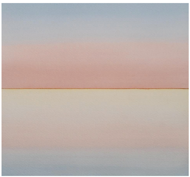
Andrew Dall'Olmo, Fabric Print of Watercolor on Paper