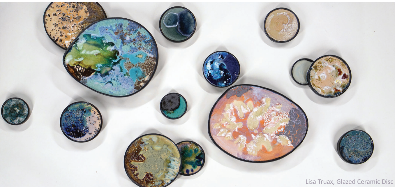
Lisa Truax, Glazed Ceramic Disc

Understanding how the human eye moves through art to interpret and appreciate a composition became 1 of 2 strategic art tools used to direct art selection. Color Theory was the second.