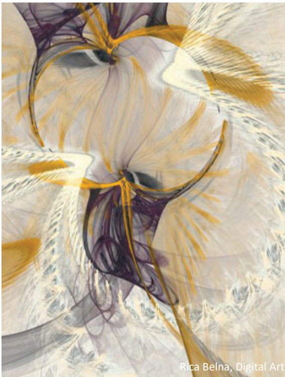
Rica Belna, Digital Art

Building design connects outpatient and inpatient treatment through five Care Communities organized by cancer type. Adjoining floors share living rooms and care teams providing seamless outpatient and inpatient care. Multi-level modern living rooms within the care communities include touches of warmth from wood and natural materials. Intentional design features bright white spaces with warm wood accents and deep blue upholstery throughout the 17 level building creating a unified building experience. Large scale multimedia art elements add a reflective touch of calm and serenity to open spaces filled with natural light.