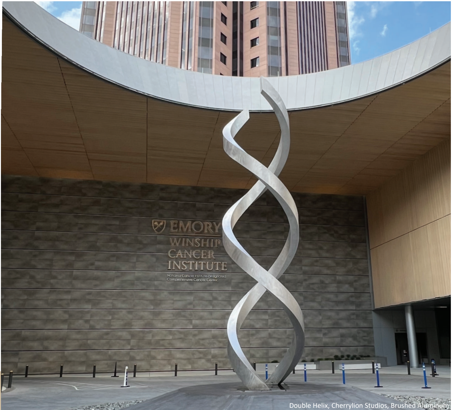
Double Helix, Cherrylion Studios, Brushed Aluminum

Skidmore, Owings & Merrill design directive “To design and build a cancer center that has never been seen or imagined” strongly informed the patient centered art approach. Selected artwork now creates supportive patient family and staff experiences in a manner that had not yet been seen or imagined.